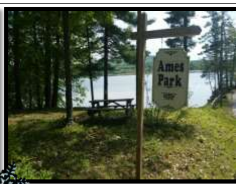
Ames Park 204 Bonnyman Road – E. Wakefield