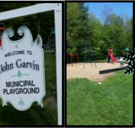
<u>John Garvin Municipal Playground</u> 1 High Street - Sanbornville