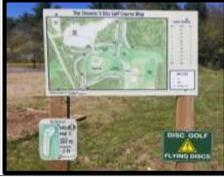
<u>Ballpark Complex & Disc Golf Course</u> 1488 Wakefield Road - Sanbornville