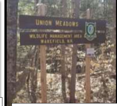
Union Meadows Wildlife Conservation Area Marsh Road