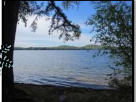
<u>Weeks Beach & Park -</u> North shore Drive E. Wakefield