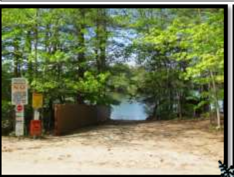
Lake Ivanhoe Boat Launch 14 Dearborn Road - E. Wakefield