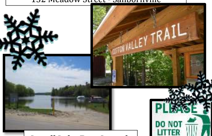
<u>Lovell Lake Boat Launch</u> Witchtrot Road Sanbornville