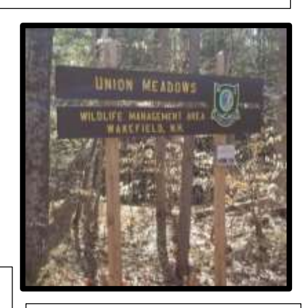
<u>Union Meadows Wildlife</u> <u>Conservation Area</u>