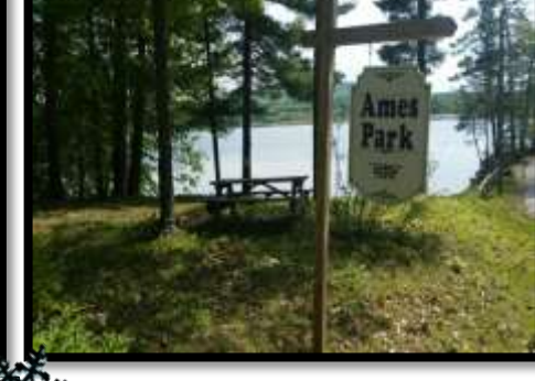
Ames Park 204 Bonnyman Road