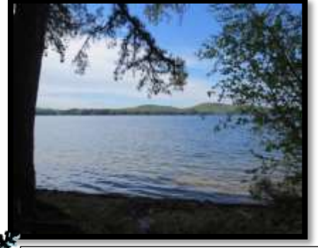
<u>Weeks Beach & Park -</u> North shore Drive E. Wakefield