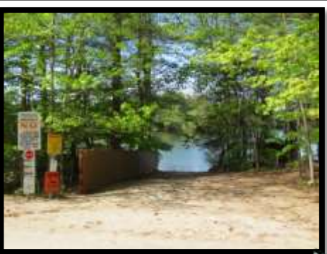
<u>Lake Ivanhoe Boat Launch</u> 14 Dearborn Road - E. Wakefield