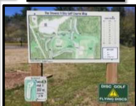
Ballpark Complex & Disc Golf Course