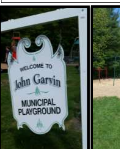
<u> Iohn Garvin Municipal Playground </u> 1 High Street - Sanbornville