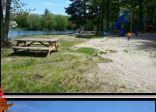
Lovell Lake Town Beach