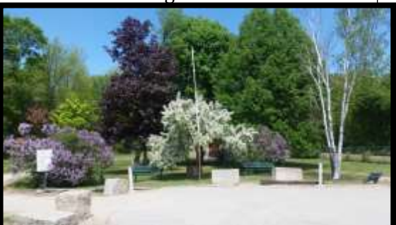
Turntable Park & Cotton Valley Trail 132 Meadow Street