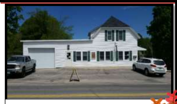
Rec Office 132 Meadow Street