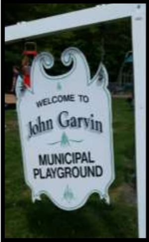
John Garvin Municipal Playground 1 High Street