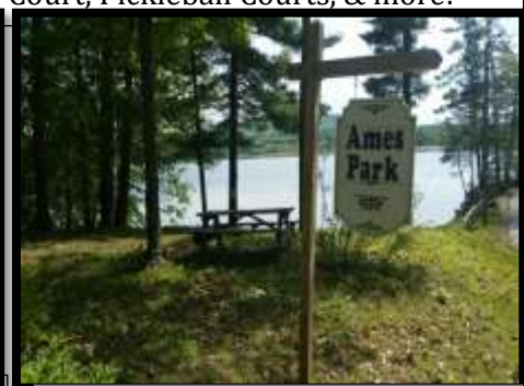
Ames Park (Province Lake) 204 Bonnyman Road